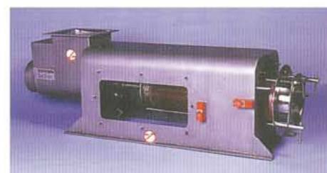
722 Centrifugal Sifter

Demerera Sugar Stearate Casein Resins Detergent Powders Phosphates Petfoods