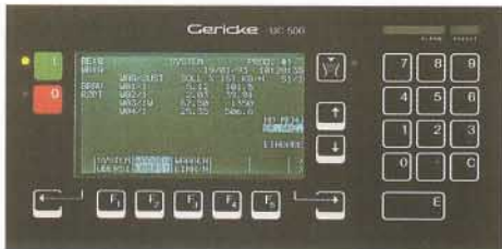
Example: System-control for 4 weigh feeders