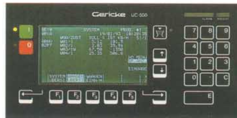
Example: System-control for 4 weigh feeders