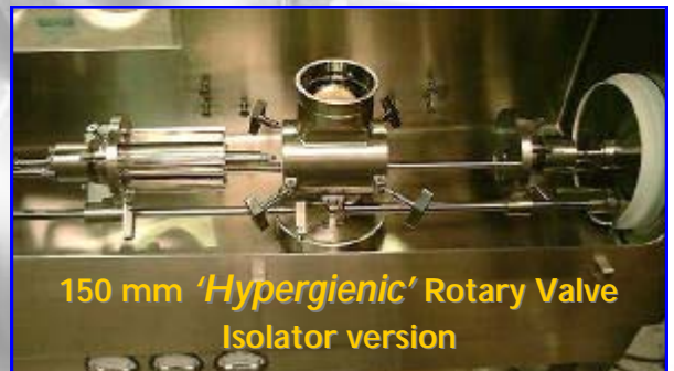
150 mm 'Hypergienic' Rotary Valve Isolator version